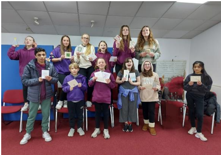
Picture of our Christmas card designs.

We hope you all have a blessed Christmas. We are looking forward to all that 2024 will bring.